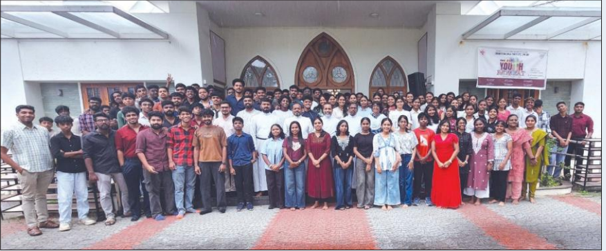
CSI Cochin Diocese Ernakulam Area One-day Youth Retreat, Elamkulam