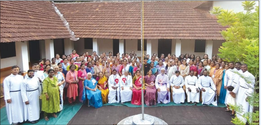
Diocesan Women's Fellowship Annual Conference - Shoranur