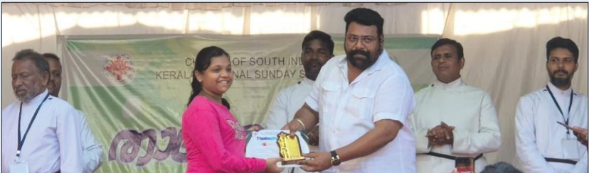
Regional Level Winners for Thalanthulsavam held on May 2 nd , 2026